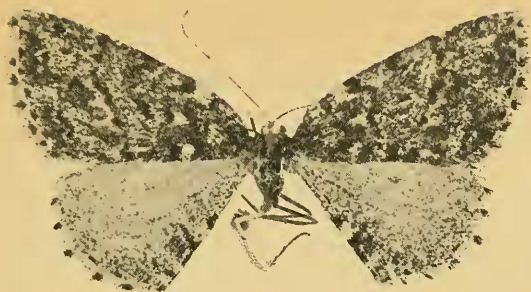
Fig. 4. Ectropis inversa n. sp. allotype ♀ (× 2).